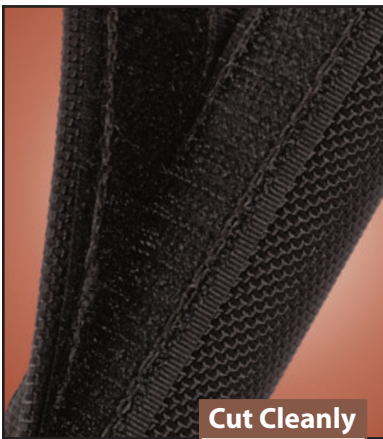
Cut Cleanly Scissor